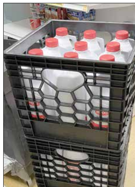
Dairy products are among the most popular items at the Neighbors Helping Neighbors food pantry in South Hadley.

“That’s an important barrier to break down because there is no reason for people to be going without food,” Guarnera