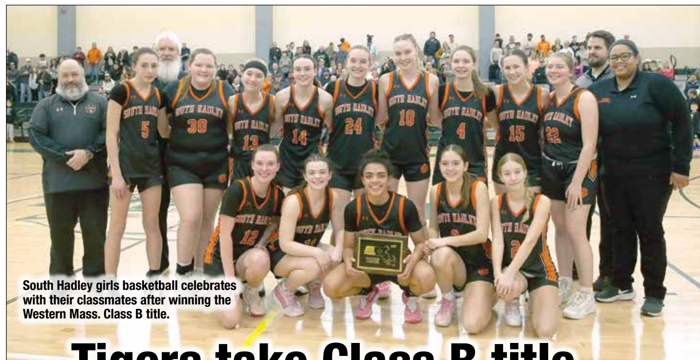
South Hadley girls basketball celebrates with their classmates after winning the Western Mass. Class B title.