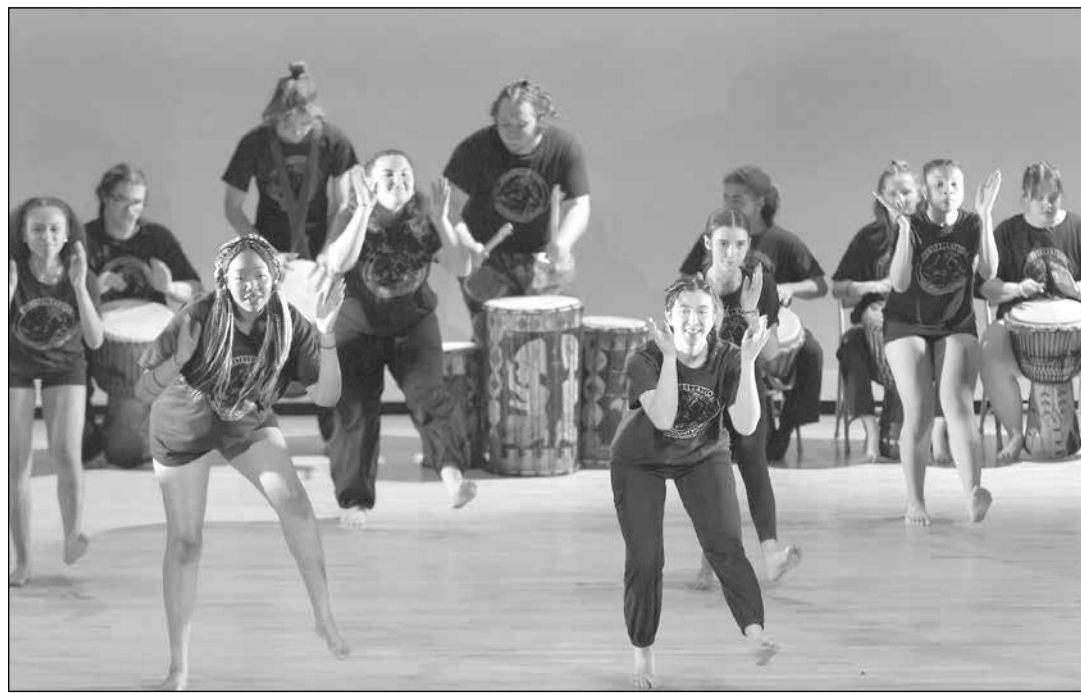
Photo of Wofa Drum and Dance Company