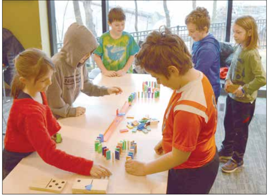
Kids work together on a domino-powered contraption during Playful Engineers at the library on Feb. 23.