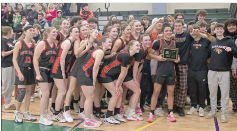
The Class B Western Mass. Champion South Hadley Tigers.