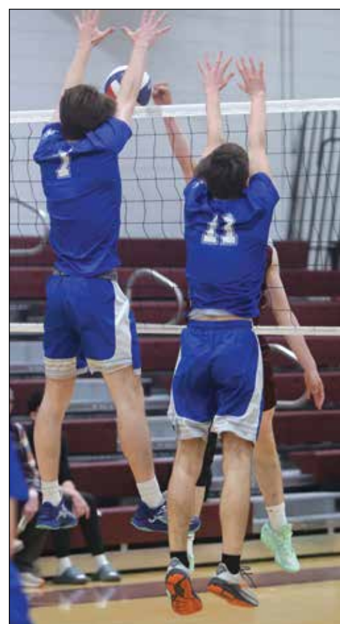
A pair of Rams go for a block.

LUDLOW – May has only just begun, but the Granby High School boys volleyball team has gotten through most of its schedule, improving to 10-5 on the season with a 3-0 sweep of Ludlow last Thursday. The Rams have just three regular season games remaining. The Rams will travel to Southwick Regional on Thursday, May 7 at 5:15 p.m.