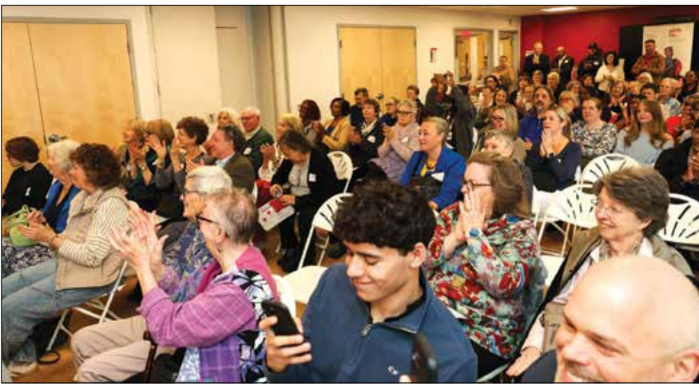
The crowd watches on as speakers address the group at the Girls Inc Grand Opening of their newly renovated headquarters.